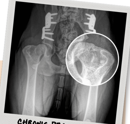
CHRONIC PROGRESSIVE BILATERAL HIP OSTEOARTHRITIS

Despite DPO, rapidly progressive left hip osteoarthritis is seen with femoral neck thickening, femoral head malformation and peri-articular osteophytosis.